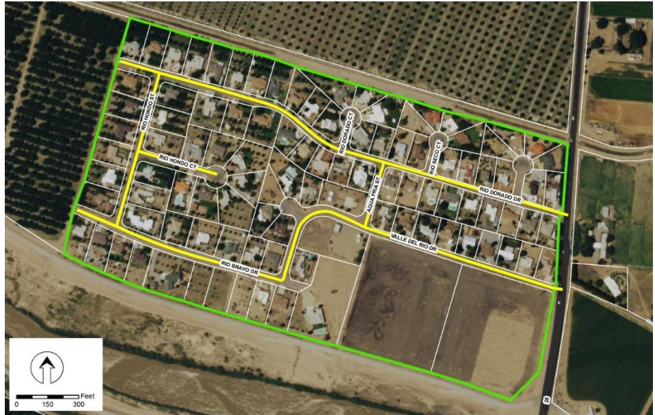
Valle Del Rio Project Area

Souder, Miller & Associates (SMA) prepared this Scope of Services to provide Planning Services to Lower Rio Grande Public Water Works Authority (PWWA) (Owner) to amend the September 2017 Preliminary Engineering Report Valle del Rio Water System Improvements for the Lower Rio Grande PWWA. SMA proposes to complete the scope of work described below.